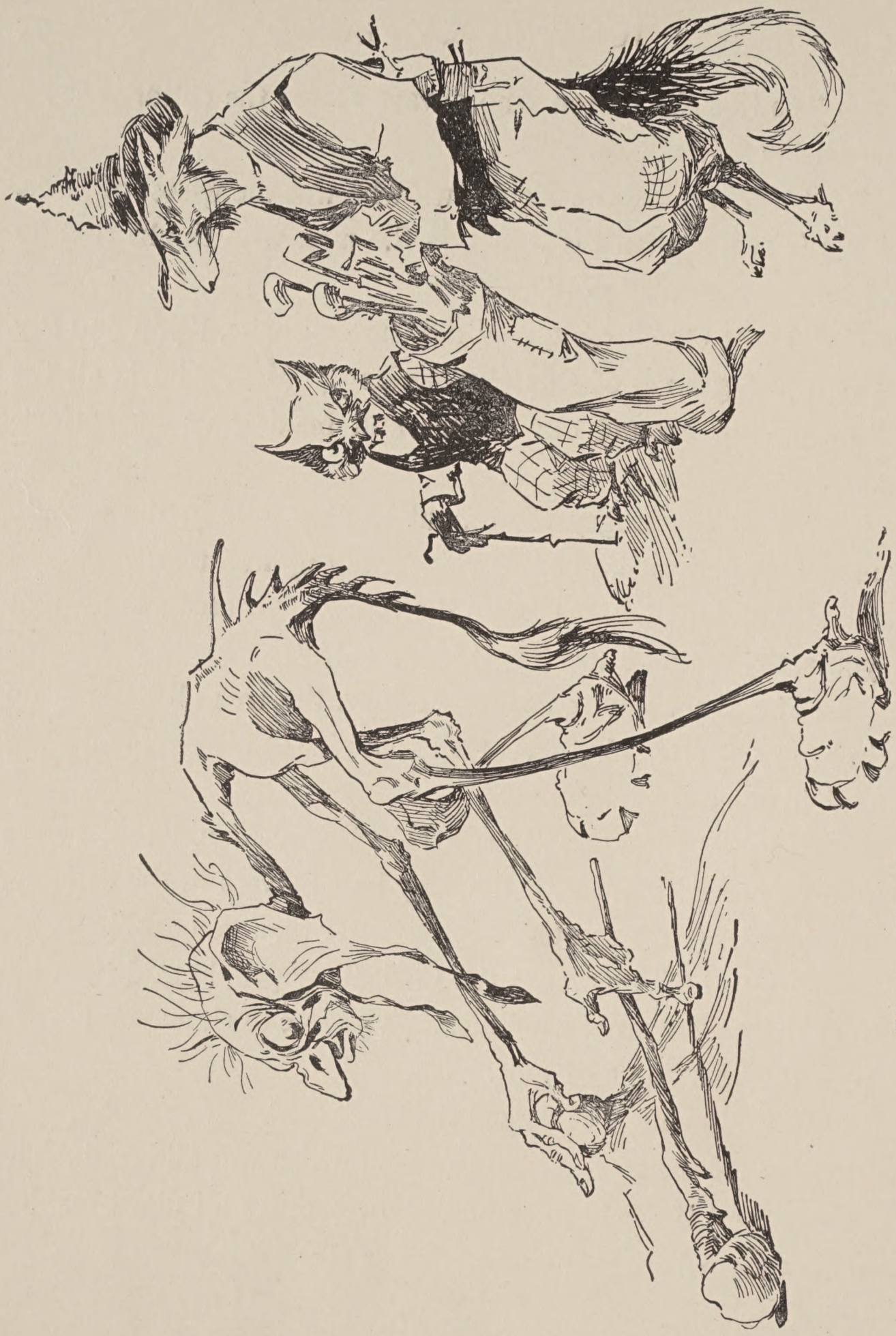
HOOT OWL SAYS THE BOGEY MAN IS LEARNING.